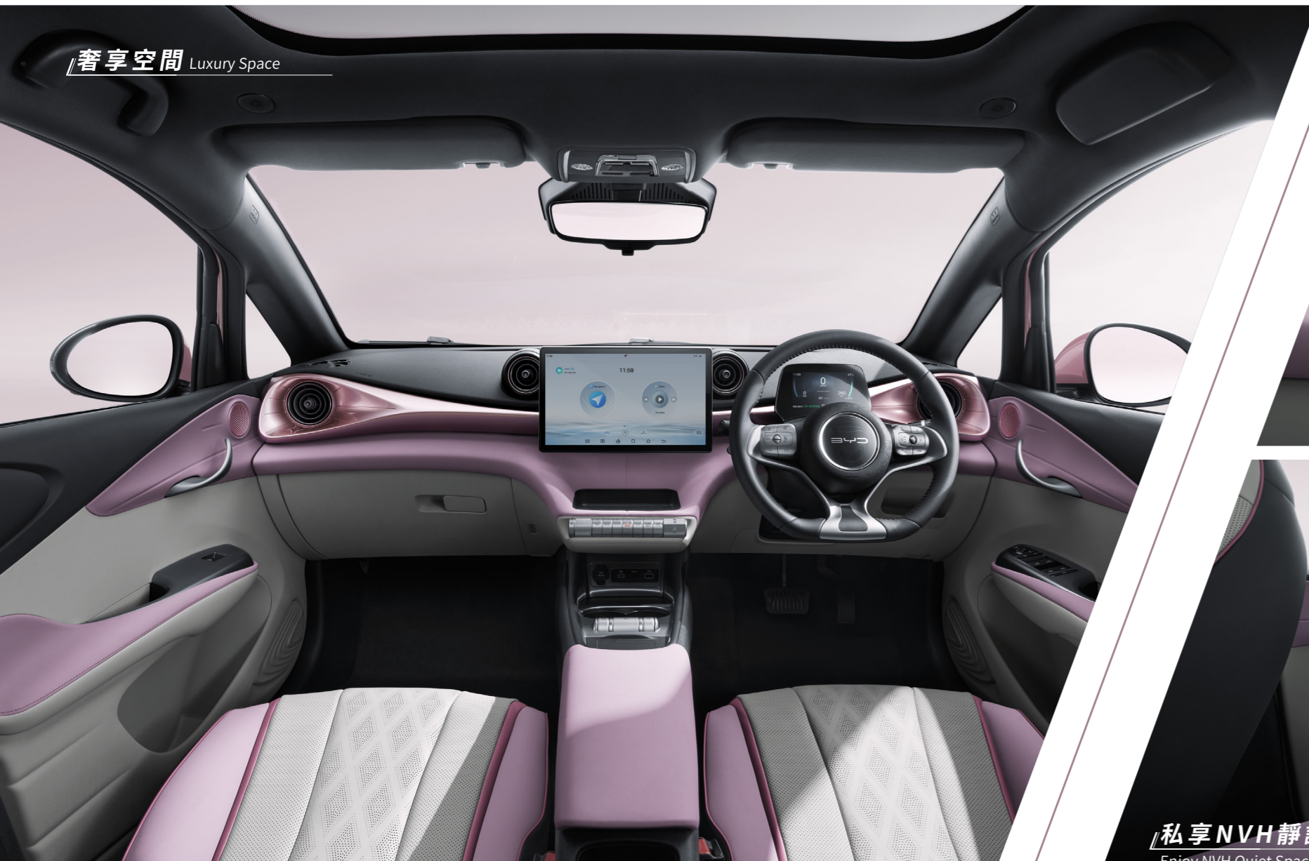
奢享空間 Luxury Space