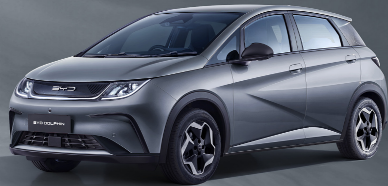
雲母灰 Urban Grey