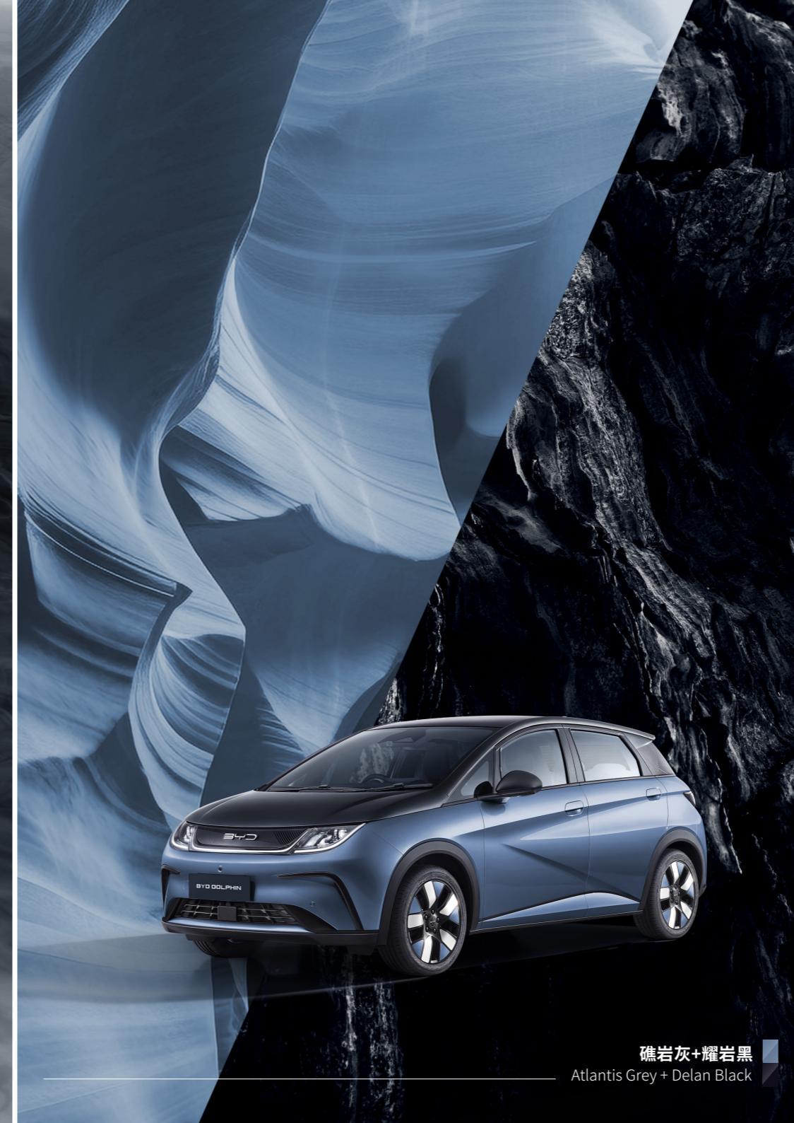
礁岩灰+耀岩黑 Atlantis Grey + Delan Black