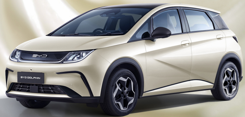
芝士黄 Sand White