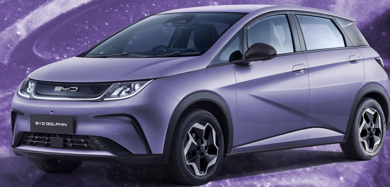
香芋紫 Maldive Purple