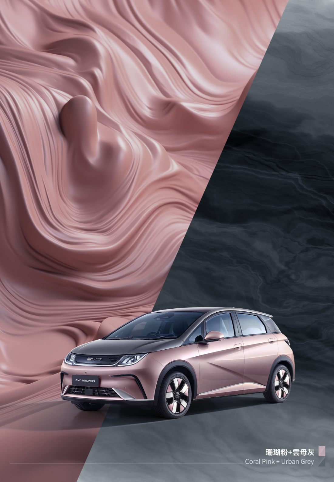
珊瑚粉+雲母灰 Coral Pink + Urban Grey