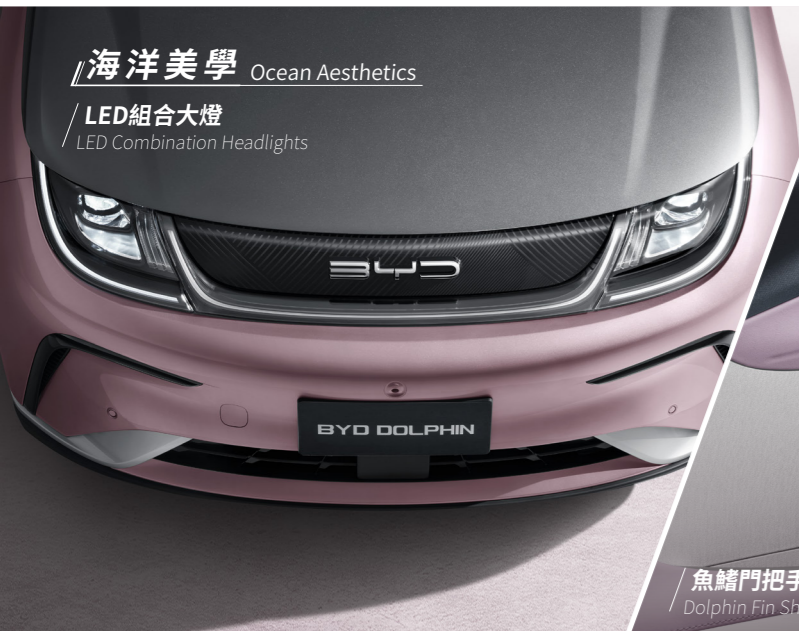
魚鰭門把手 Dolphin Fin Shaped Handles