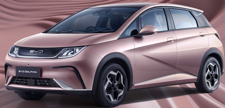
珊瑚粉 Coral Pink