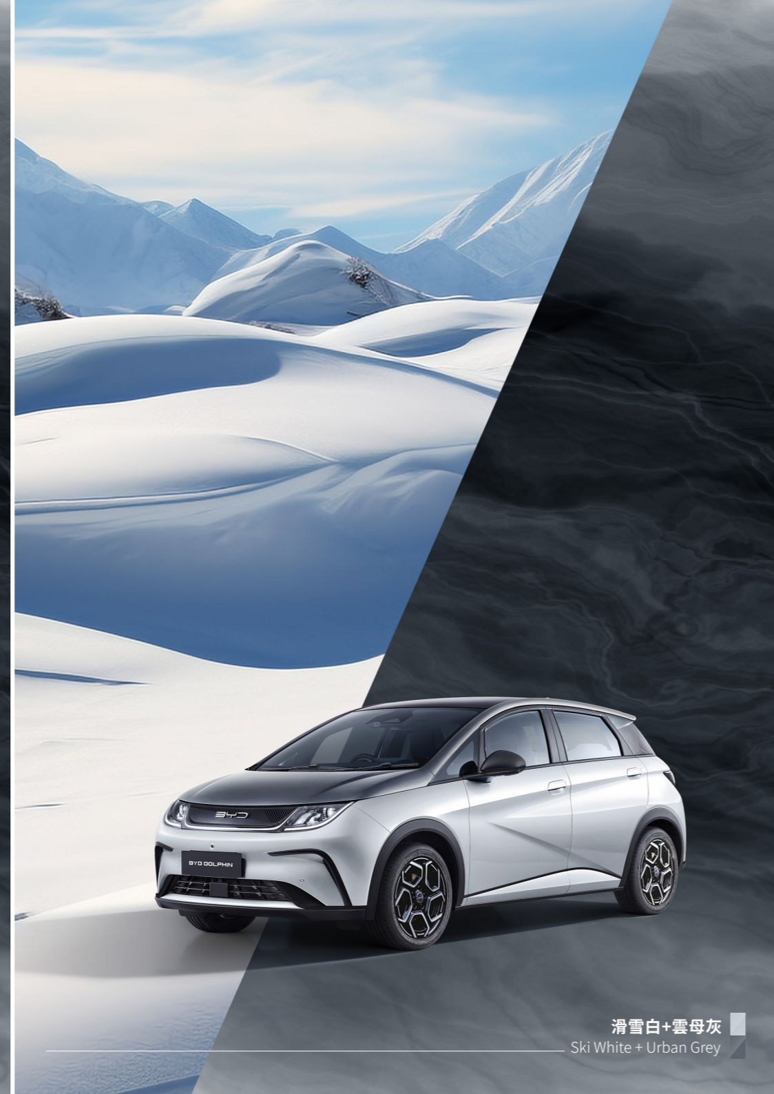
滑雪白+雲母灰 Ski White + Urban Grey