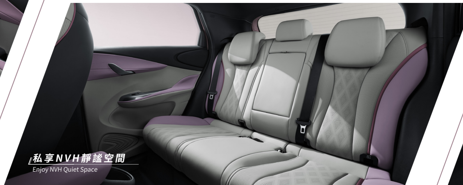
私享NVH靜謐空間 Enjoy NVH Quiet Space