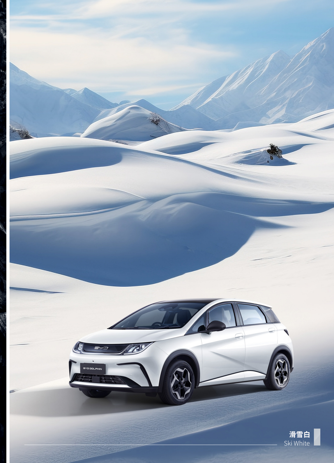
滑雪白 Ski White