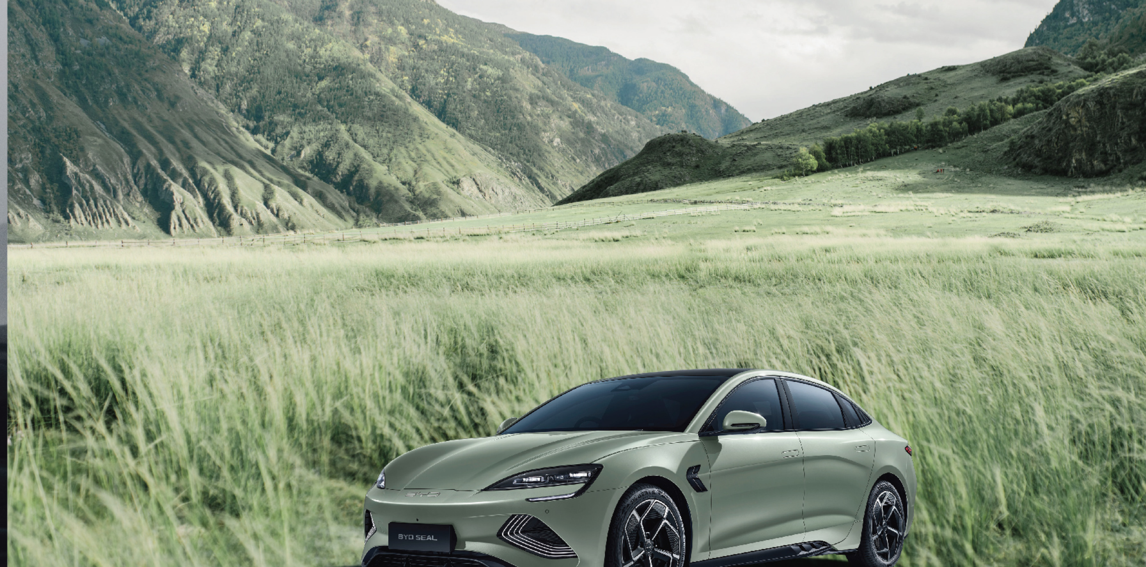
風卷草綠 MYSTIC GREEN