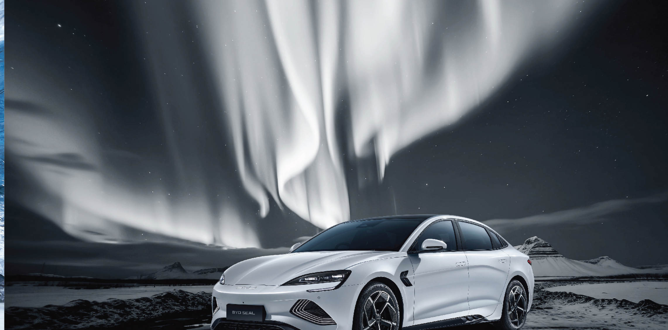
極光白 AURORA WHITE