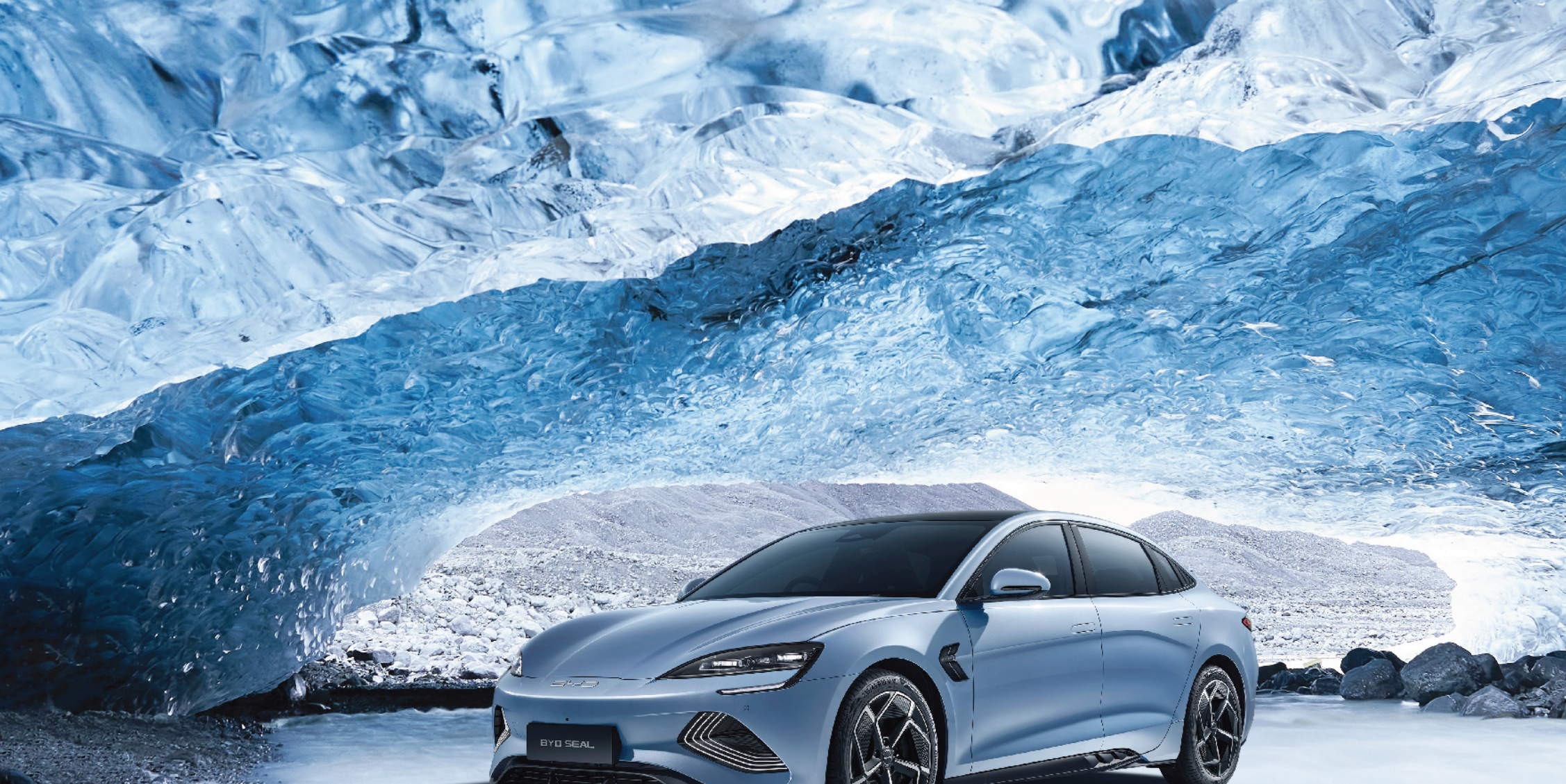
北冰藍 ARCTIC BLUE