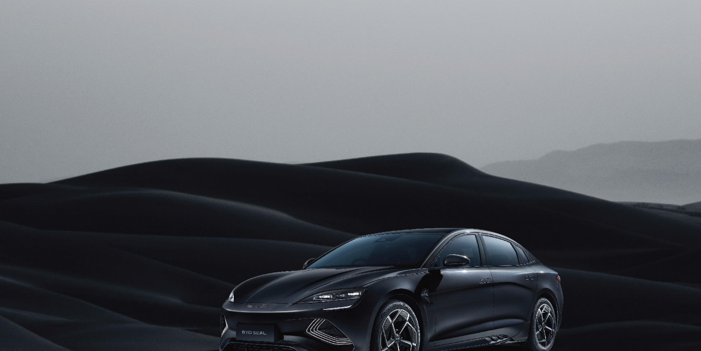
玄空黑 COSMOS BLACK